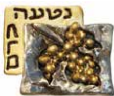
New Torah Fund pin for 5776

As of the first week of October, the Adas Israel Torah Fund campaign reached 30% of its 5776 goal. This is a wonderful start to the year, but we still some distance to go. We thank all of our wonderful supporters and extend an appeal to those who have yet to make a gift to plant today for tomorrow in support of our Conservative/Masorti seminaries and professional communal leadership programs.