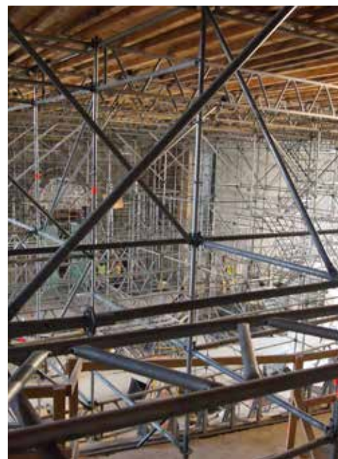
Believe it or not, this will be the Charles E. Smith Sanctuary!