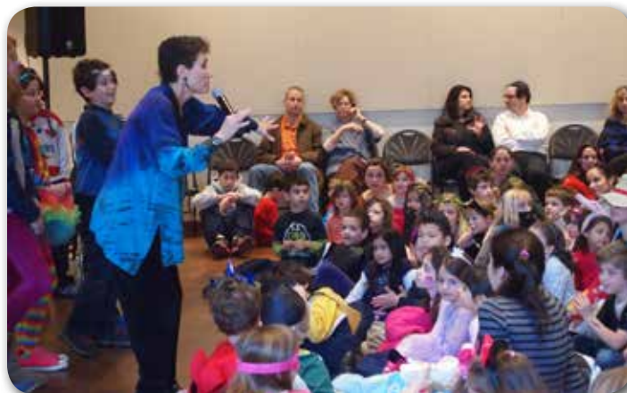
▲ The Megillah Thrilla!

28: Lag B'Omer ; Lag B'Omer program; Chugim (Specials) for grades 3–6; USY & Kadima Kings Dominion Day