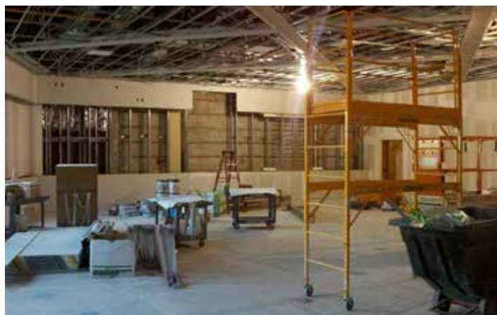
The Gewirz Beit Am as of November 30, finally coming into focus with the installation of drywall.