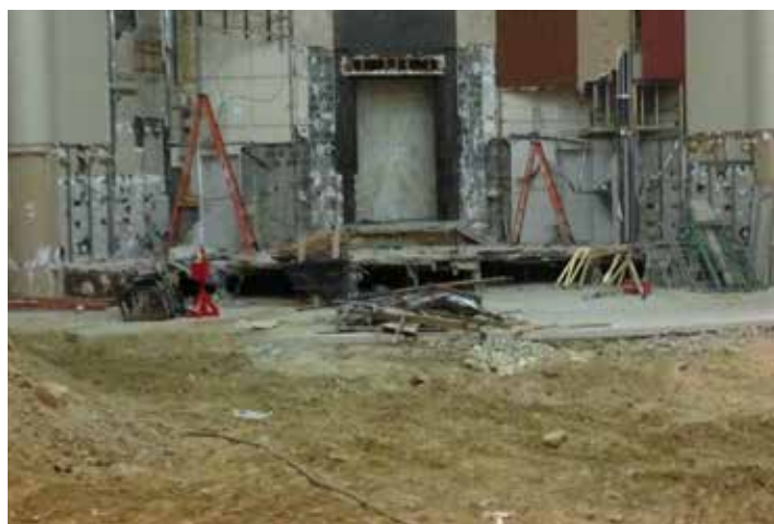
Currently under construction—the future Charles E. Smith Sanctuary.