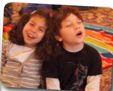
On February 5, students in PreK–2nd Grade and their families celebrated Tu B'Shevat at a special Shacharit Live by singing songs, eating fruits

from trees, learning about trees, and watching a skit performed by our madrachim (teen assistants).