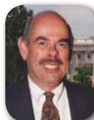
Congressman Henry Waxman