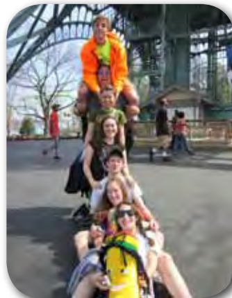
Adas Israel Kadimaniks and USYers have a blast at the Seaboard Region Kings Dominion trip!

Our month of April was filled with the sounds of boisterous voices and thrilling screams. Adas Israel USY and Kadima enjoyed the many beautiful voices of the first Jewish collegiate cappella competition. We finished the month's events before Pesach with the Seaboard USY and Kadima Kings Dominion Day. It was a day filled with games, roller coasters, food, and friends.