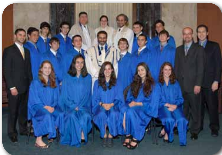
The Adas Israel Confirmation Class of 5770.