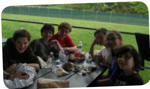
Kadimaniks take a lunch break at the Seaboard Region annual trip to Kings Dominion. Over 300 kids attended this year!

Watch for Encampment applications; you should send them in as soon as you can. You don't want to miss this awesome week of great programming with the whole Seaboard Region!