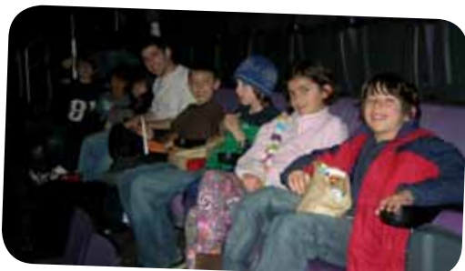
Machar kids kick back and enjoy a Wizards game at Verizon Center

Our next event is March 21, at All Fired Up to make our very own pottery! This will be an awesome program, one that you don't want to miss! Check the flyer that has been sent out for more details!