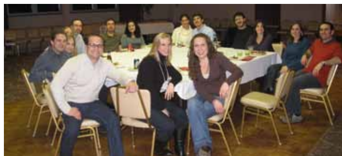
Ketubah Klub members enjoy one another's company at our January Havdalah and dinner event.

Adas Israel invites young professionals from the Greater Washington community to join us at our synagogue's second-night seder . Young professionals (between the ages of 21 and 35) get a heavily discounted price of $20 to participate. If you're interested in joining us, please send in your check, payable to Adas Israel, by March 5.