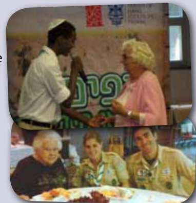
The Adas Israel Seniors welcomed the Israeli Scouts Tzofim Friendship Caravan for an afternoon of Israeli songs and dance.