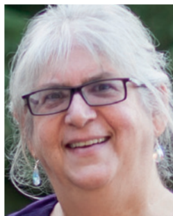
by Audrey Berner