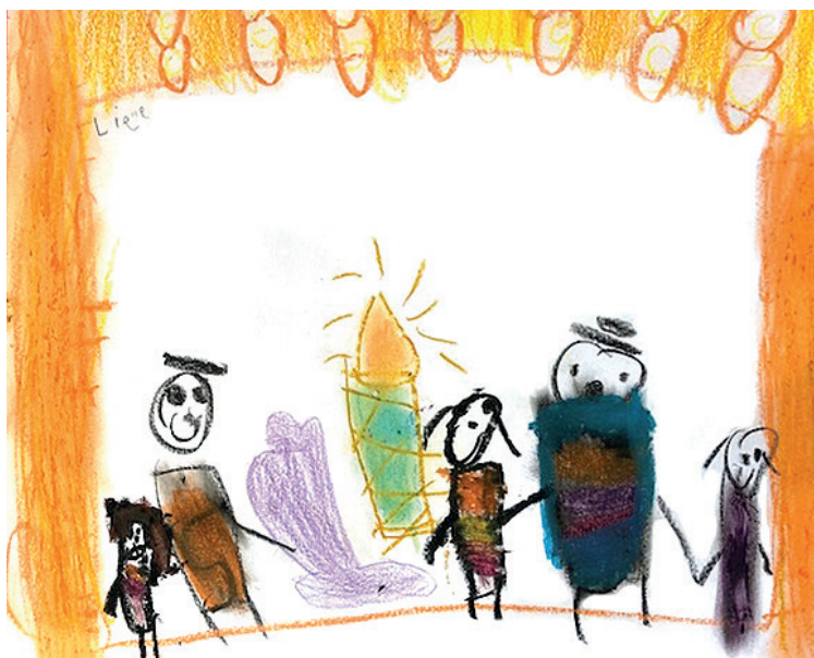
5 year old Lielle Lesk's rendition of havdalah. Pictured in purple on the left is a kiddush cup - she must like wine!

And I hope to see you there, too! Look in the weekly newsletter for upcoming dates.