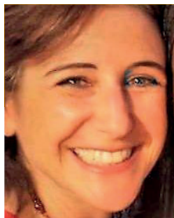
by Ronit Yarosky

Fundraising is often thought of as a dirty word. People always ask me "how can you ask people for money?" – I must hear that question every day.